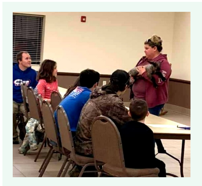
February Livestock Club Meeting Demonstration on tail docking and orphan lamb care

May 24, 2023 – Market Lamb, Goat, Hog Validation Form Deadline...Market Lamb, Goat, Hog DNA Envelopes must be in-hand of Kentucky State Fair by end of business day 5/24/2023 OR post-marked by 5/24/2023. NO EXCEPTIONS