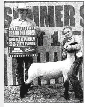
olding her champlor