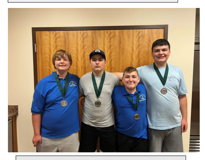
4-H Jr Chef/Culinary placed 3rd in the Farm to School Jr. Chef Competition this year.

required to have 6 education hours. This is a rule to be allow to do the County Ham project. You can attend a club meeting on the 3rd Tuesday of each month. If you don't get your education hours you will not be allowed to do the Ham project. Also, required is a speech at the Kentucky State Fair in the summer. You can stop by the Extension Office and pick up your contract today.