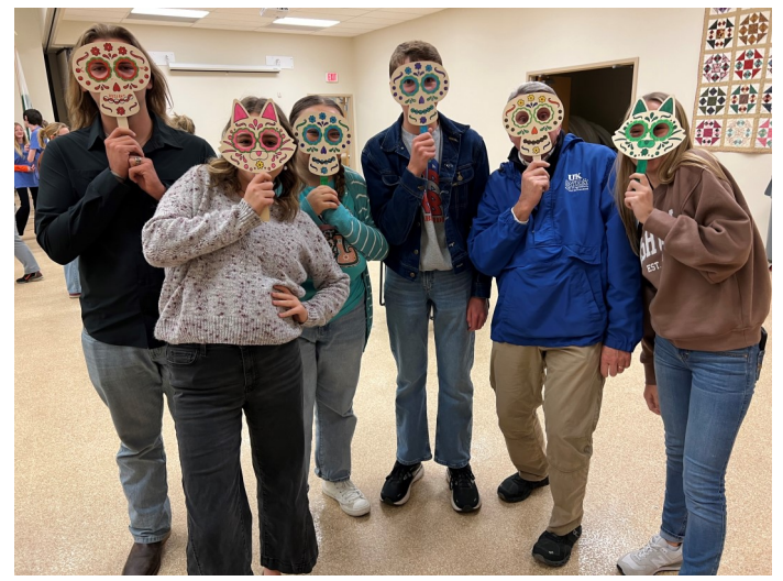
SCARY 4-H YOUTH ATTEND MIDDLE SCHOOL RETREAT AND GET INVOLVED IN LEADERSHIP ACTIVITIES.