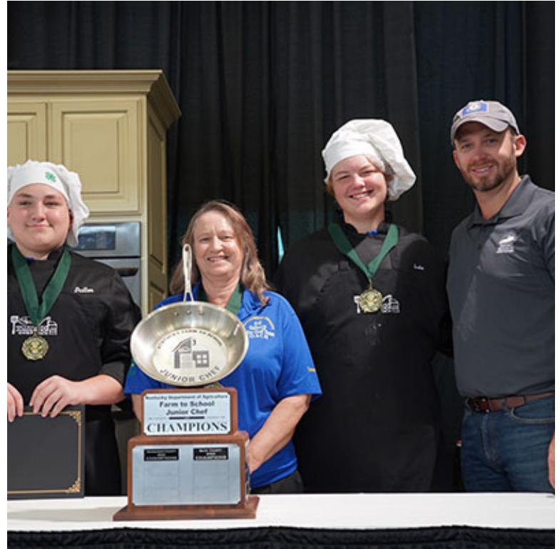
4-H Culinary Team at State Fair

Culinary Challenge is a state-level event that ends a year's worth of work in the kitchen. As the 8th Annual Culinary Challenge wraps up it experienced another record year in attendance. Youth participation increased by 30% and has had a compound growth of 400% in the past five years. After the event, 95% of young people reported high levels of improvement in knife skills with all young people reporting some level of improvement. Youth also reported a great deal of teamwork and kitchen management skills developed because of the program. This high confidence in critical skills is a result of consistent work with 4-H agents and Volunteers. Youth reported an average of being engaged in 4-H activities for 3 hours a week. These skills have been identified as making a candidate highly qualified for positions in Culinary Arts, giving the young people who participate in Culinary Challenge programming a head start on career advancement.